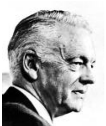
Robert M. Hutchins

T he tradition of the West is embodied in the Great Conversation that began in the dawn of history and that continues to the present day. Whatever the merits of other civilizations in other respects, no civilization is like that of the West in this respect. No other civilization can claim that its defining characteristic is a dialogue of this sort. No dialogue in any other civilization can compare with that of the West in the number of great works of the mind that have contributed to this dialogue. The goal toward which Western society moves is the Civilization of the Dialogue. The spirit of Western civilization is the spirit of inquiry. Its dominant element is the Logos . Nothing is to remain undiscussed. Everybody is to speak his mind. No proposition is to be left unexamined. The exchange of ideas is held to be the path to the realization of the potentialities of the race.