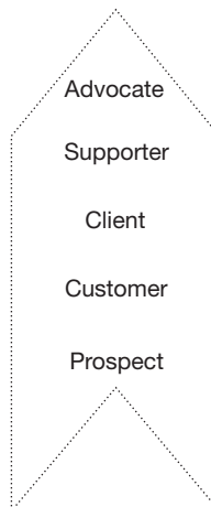
Figure 12.2 The ladder of consumer/buyer commitment

Several levels of commitment can be identified. A prospect has yet to establish a relationship, whereas a strong advocate is fully committed not only to product purchase for themselves but also to recommending to associates, friends, and family – see Figure 12.2.