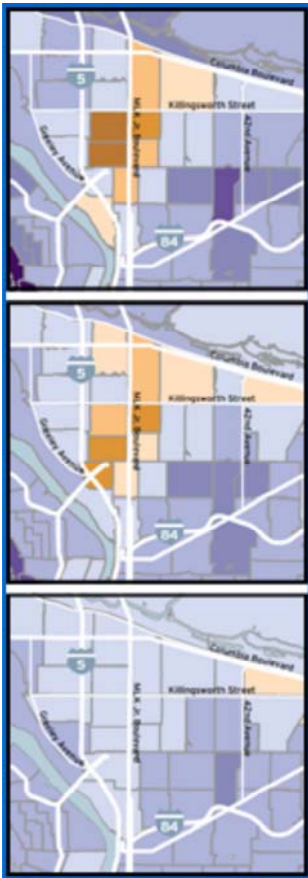
GRAPHIC: PORTLAND'S CENTRAL CITY GETS WHITER

MORE: WHAT PORTLAND LEADERS DID — AND DIDN'T DO — AS PEOPLE OF COLOR WERE FORCED TO THE FRINGES