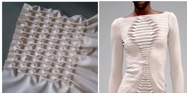
Figure 3: Lozenge Smocking