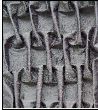
Figure 2: Lozenge Smocking Pattern (Singer 2013)

follow two basic stitch sequences. In the first sequence, the two stitches together are pulled as per a and b in figure 1. The Lozenge pattern is worked on the wrong side of the fabric (Acolchado 2012). The next sequence is when one goes from b to c but do not pull the stitches. One third of the pleat is caught while working out smocking stitches.